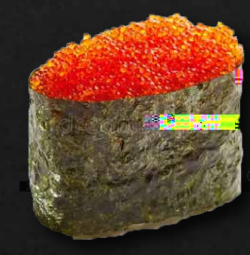
Tobiko flying fish roe